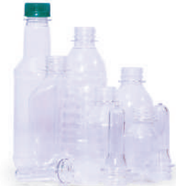
Transparent liquid containers 1L, 500mls, 200mls, 100 mls and 50 mls size