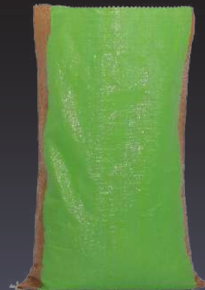
Green/Red PP Woven bag

Available in 10kg, 15kg, 20kg, 10 kg, 25kg, 50kg and 100kg sizes