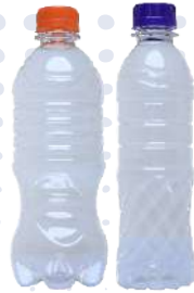
Transparent twist liquid containers 1L, 500mls, 200mls and 100 mls size