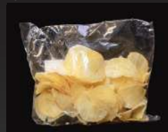
Crisps (Potato chips)