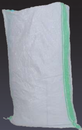
Green strip PP Woven bag

Available in 10kg, 15kg, 20kg, 10 kg, 25kg, 50kg and 100kg sizes