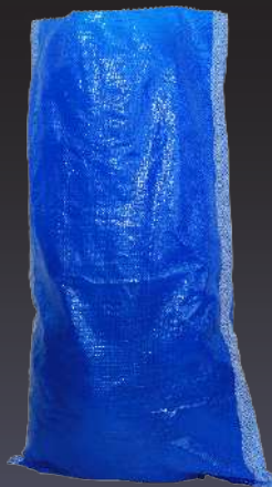
Blue/White PP Woven bag

Available in 10kg, 15kg, 20kg, 10 kg, 25kg, 50kg and 100kg sizes