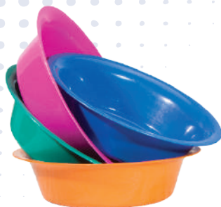
Small Wash Basin / Kataasa