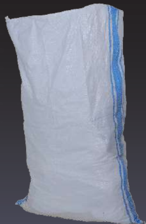
Blue strip PP Woven bag

Available in 10kg, 15kg, 20kg, 10 kg, 25kg, 50kg and 100kg sizes