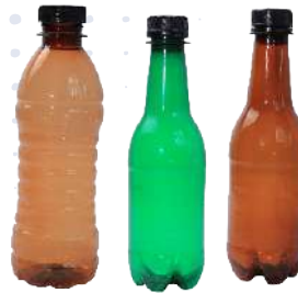
Colored Translucent liquid containers 1L, 500mls, 200mls and 100 mls size