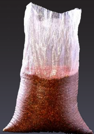
PP Transparent Woven bag

Available in 10kg, 15kg, 20kg, 10 kg, 25kg, 50kg and 100kg sizes