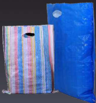
PP Woven bag Shopping Bags with polythene interior.