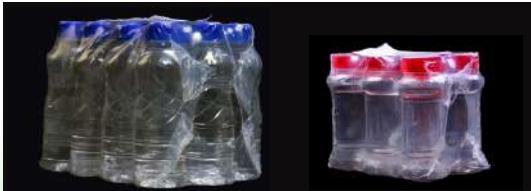
Shrink wrapping for bottles