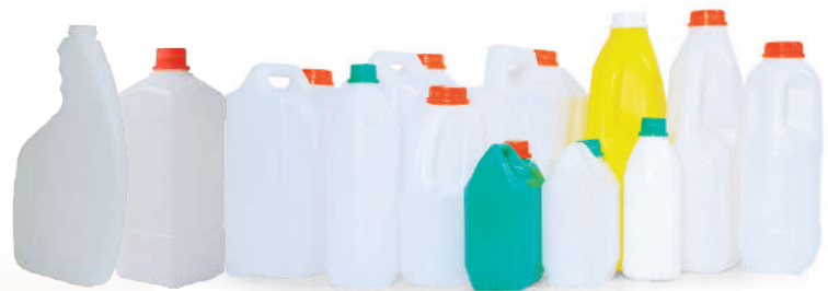
Small Jerrycans 1L, 3L and 5L size