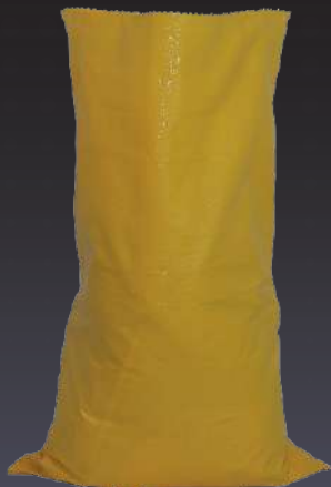
Yellow PP Woven bag

Available in 10kg, 15kg, 20kg, 10 kg, 25kg and 50kg sizes