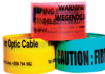
Barricade/ Caution Tape