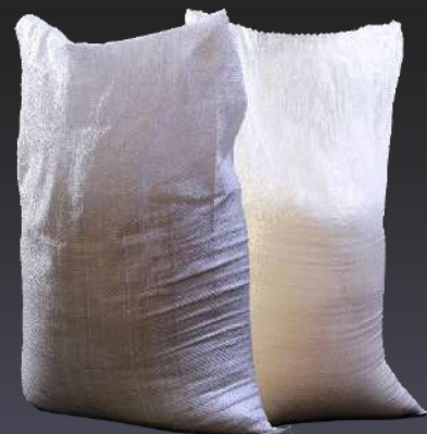
Plain white PP Woven bag.

Available in 10kg, 15kg, 20kg, 10 kg, 25kg, 50kg and 100kg sizes