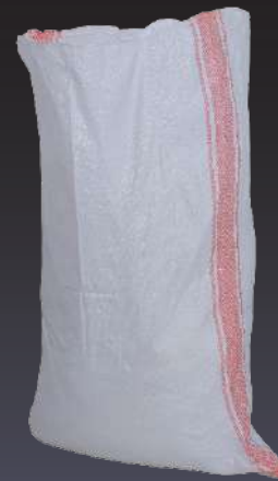
Red strip PP Woven bag

Available in 10kg, 15kg, 20kg, 10 kg, 25kg, 50kg and 100kg sizes