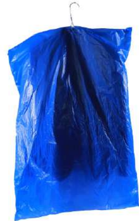
Dry cleaning / Laundry Bags