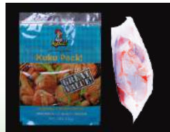
chicken / meat