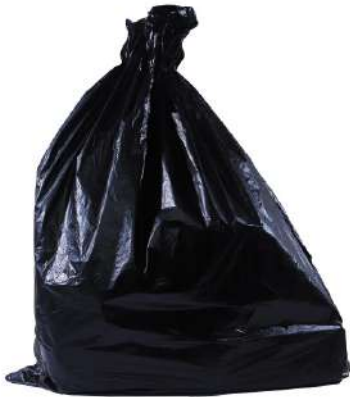
Garbage /Bin Bags